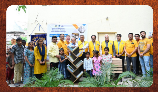
5 BOOK SHELVES DISTRIBUTION IN SCHOOLS