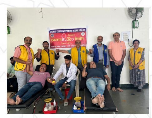
BLOOD DONATION CAMPS