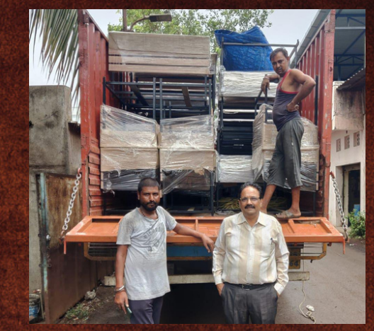
TABLES & BENCHES DISTRIBUTION TO SCHOOLS