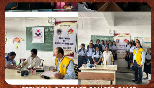
CERVICAL & BREAST CANCER CAMP