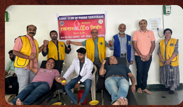
3 BLOOD DONATION DRIVE - 195 BOTTLES COLLECTED