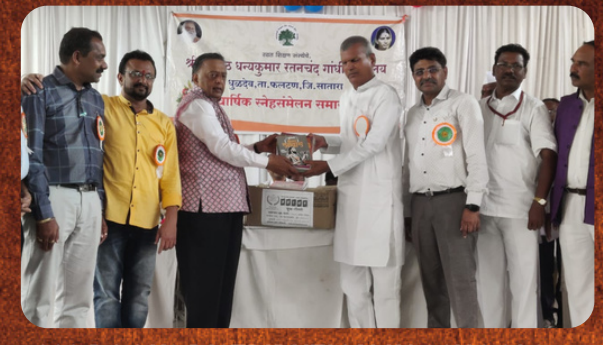
300 BOOKS DISTRIBUTION IN SCHOOLS