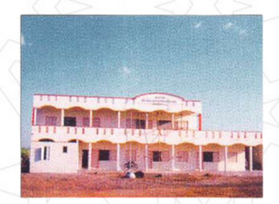
GANDHI SCHOOL, PHALTAN