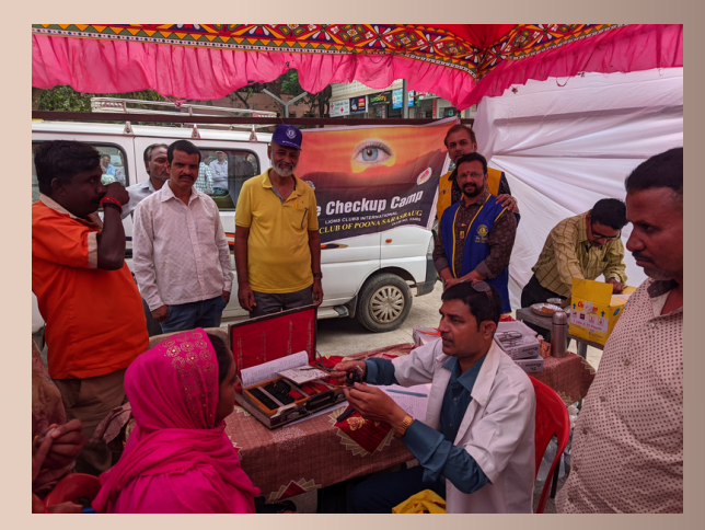
*EYE CHECK-UP CAMP*

IN THE LAST 4 MONTHS THE LIONS CLUB OF POONA SARASBAUG HAS CONDUCTED 2 MEGA EYE CHECK-UP CAMPS, THAT HAS SEEN 719 BENEFICIARIES, OF WHICH 237 WERE GIVEN FREE SPECTACLES AND 27 WERE REFFERED FOR CATARACT SURGERY.