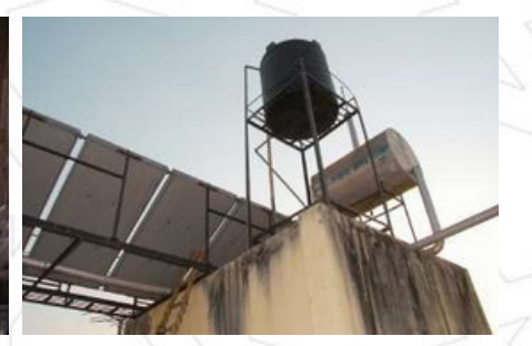
HOSTEL, PLAY EQUIPMENT, FURNITURE & SOLAR WATER HEATER AT JEEVAN JYOT MATIMAND VIDYALAYA KARVENAGAR