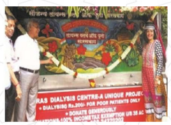
PAN POI, SARASBAUG