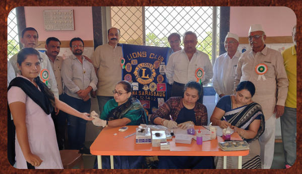
DIABETES CHECK-UP CAMP