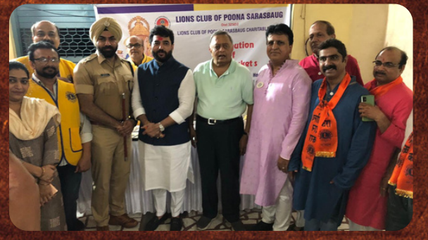
2500 FOOD PACKETS DISTRIBUTION TO PUNE POLICE & HOMEGUARDS DURING GANESH VISARJAN