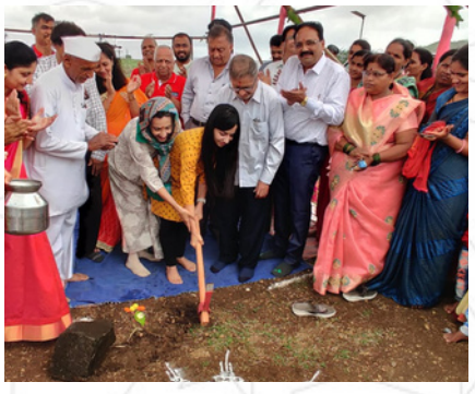
BHOOMI PUJAN OF SOON TO BE CONSTRUCTED VRIDHASHRAM AT AMBI VILLAGE, TALEGAON.