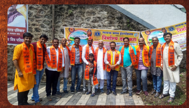
NIRMALAYA DAAN ACTIVITY