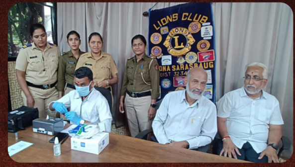
KIDNEY CHECK-UP CAMP