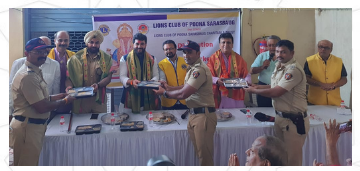
FOOD PACKET DISTRIBUTION TO POLICE & HOMEGUARDS DURING GANESH VISARJAN