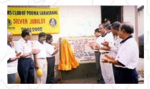
COMMUNITY HALL, BHUJ, GUJARAT