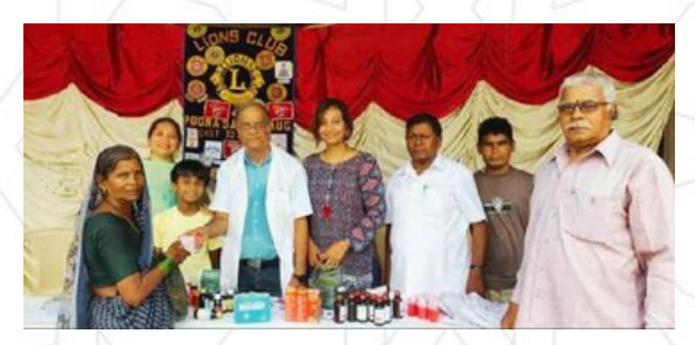
FREE HEALTH CHEK-UP CAMP FOR WARKARIS