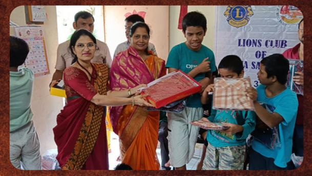
SCHOOL UNIFORM DISTRIBUTION