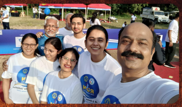
RUN FOR DIABETES