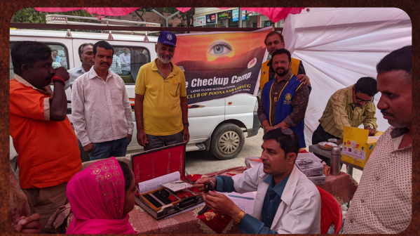
692 BENEFICIARIES - FREE EYE CHECK-UP CAMP