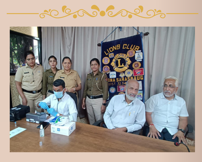
*KIDNEY CHECK-UP CAMP*

THE LIONS CLUB OF POONA SARASBAUG HAS CONDUCTED 2 MEGA DIABETES CHECK-UP CAMP HAVING 851 BENEFICIARIES OUT OF WHICH 500 WERE KIDS AT A TOTAL COST OF RS. 20,000/-