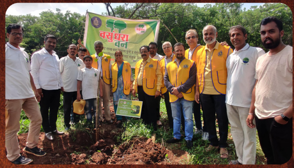
1300 TREES PLANTED