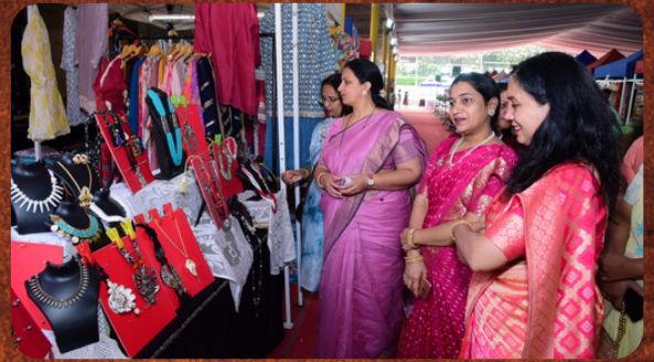
SARAS FLEA EXPO - WOMEN EMPOWERMENT