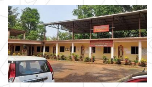
CONSTRUCTION OF ENTIRE 1ST FLOOR AT KANISHT MAHAVIDYALAYA, NAYASHI, CHIPLUN