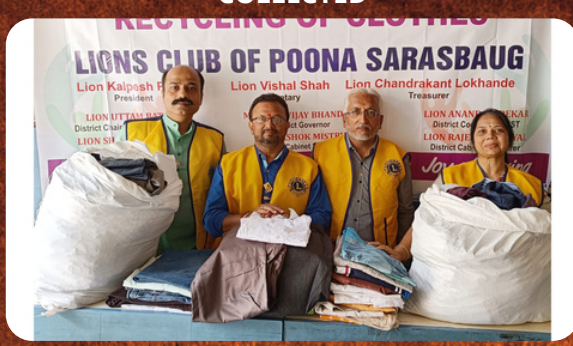
RECYCLING OF CLOTHES DRIVE