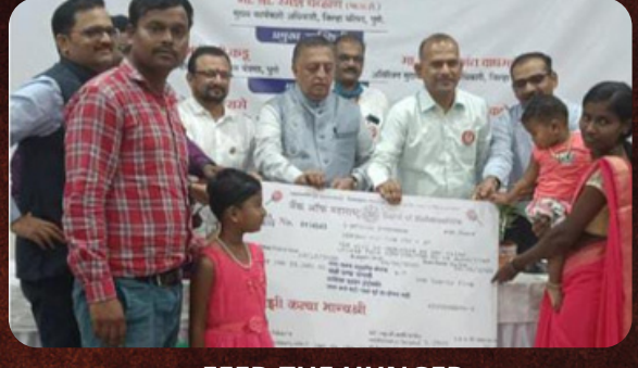
FEED THE HUNGER